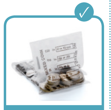
Place coin into sachets

The product is aimed at average deposits of between £1,500 and £10,000 of mixed notes and no more than £60 of mixed coin. This will prevent the wallet from being damaged in transit and keep the contents safe and secure.